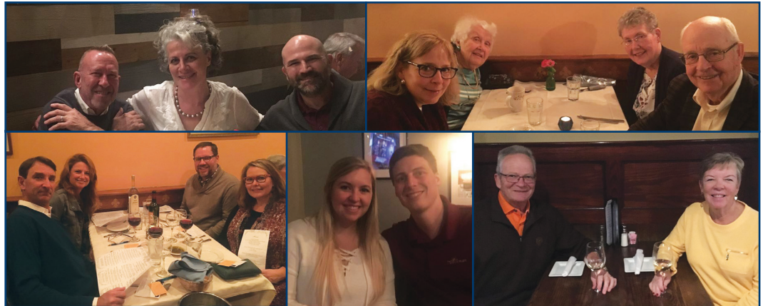
Guests enjoying a night out in support of Dine Around West Chester.