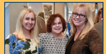
2018 Art of Caring event guests.